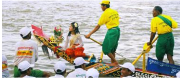
Water Festival, Phnom Penh, Cambodia ប្រពៃណី អង្គុល