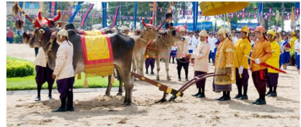
Every year, Cambodian farmers anxiously await the predictions at the end of this ritualistic ceremony, which they observe with strong faith and belief. Most Cambodians today still consult traditional manuals before making any major decisions regarding business matters or meeting important persons, etc.