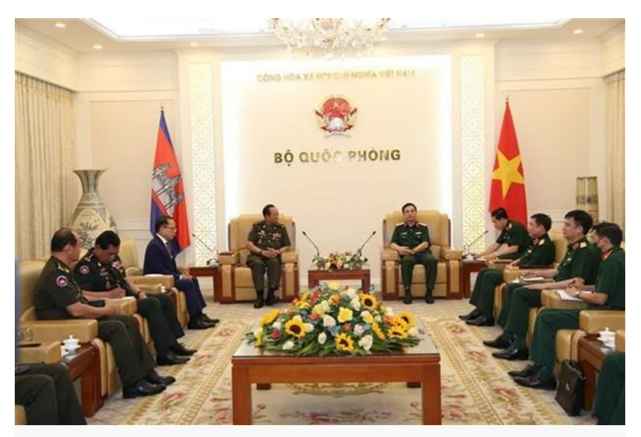
Minister of National Defense Gen. Phan Van Giang held a reception for visiting Cambodian Deputy Prime Minister and Minister of National Defense Tea Banh in Ha Noi on May 23.

Expressing his delight at the success of the first ministerial-level Vietnam-Cambodia border defense exchange, Minister Giang highlighted its significant meaning in strengthening the two countries' solidarity and friendship.