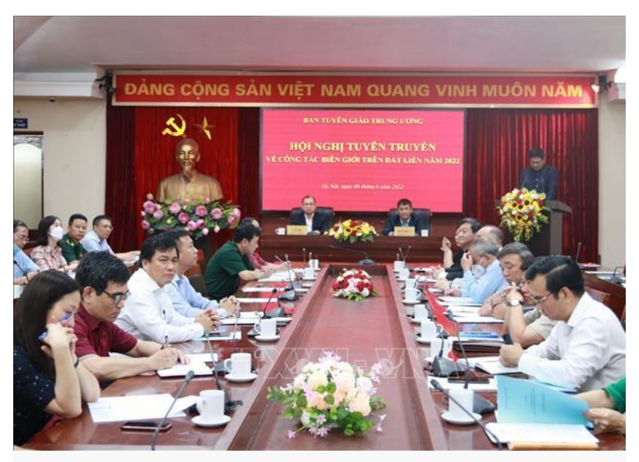
The conference on communication work on land border affairs in 2022 was held in both in-person and online forms on June 8.

Communication activities play an important role in the management and protection of the national land border, said Le Hai Binh, deputy head of the Party Central Committee's Commission for Education and Popularisation.